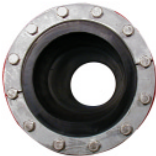
In the open position, the Weirflex is full-ported with no obstructions

Operation of the valve is simple: turning the handwheel raises the bottom pinch bar beneath the sleeve. This pinching action against the sleeve creates a weir that can easily be adjusted to suit the flow rate desired. A position-indicator rod rising from the handwheel of the Series 75 CSO provides a visual reference of valve position.