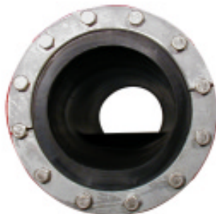
Throttling the Weirflex adjusts the level or flow rate of stormwater