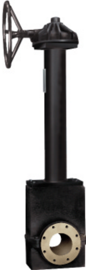
* Patent Applied

The new Weirflex from Red Valve is designed specifically to meet the needs of stormwater and combined sewer systems. Acting as an adjustable weir, the valve is infinitely adjustable from a full-port opening to a 98% closure, allowing flow rates of incoming stormwater or discharged effluent to be controlled.