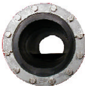
Throttling the Weirflex adjusts the level or flow rate of stormwater