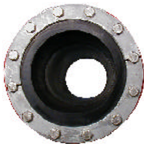
In the open position, the Weirflex is full-ported with no obstructions