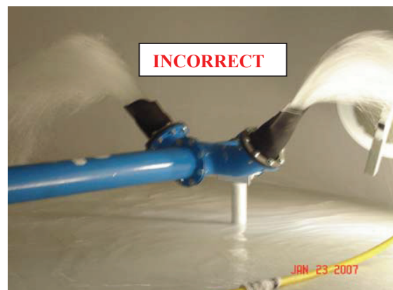
InCorrect Orientation with Tideflex Bill in Horizontal Position